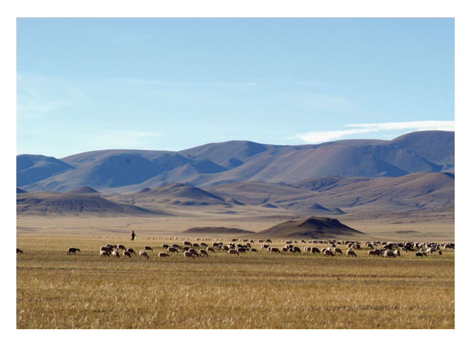
Photo 11.4 Sheep herding at 4,870 m in the south of the case study area

rolling hills that are sparsely vegetated by Stipa and Stipa-Carex zones and various dwarf herbs and scrubs.<sup>5</sup> Pastoralists in the case study area camp or dwell at widely scattered sites between 4,700 and 5,000 m; this represents both the northern and upper altitudinal limit for permanent human settlement on the Tibetan Plateau. Many of their encampments are now reachable via simple vehicle tracks but are remote in the sense that they are often located 100–200 km from the nearest county town. The local form of pastoralism depends largely upon sheep and goat herding (Photo 11.4), with only a small number of yak. A few horses and dogs are maintained as working animals. Pastoralism on the northern Changtang is marginal compared to many wetter, warmer and lower regions to the south and east of the Plateau. Whilst herd sizes are relatively small and animal product yields are typically modest by most regional standards, many Tibetans from outside the case study area maintain that its livestock often have tastier meat and fat, and that wool/hair quality (especially from goats) is high.