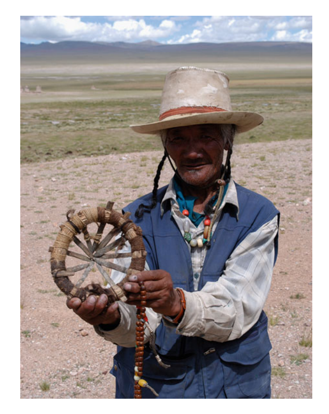
Photo 11.3 Retired hunter with a khogtse leghold trap in northern Gertse