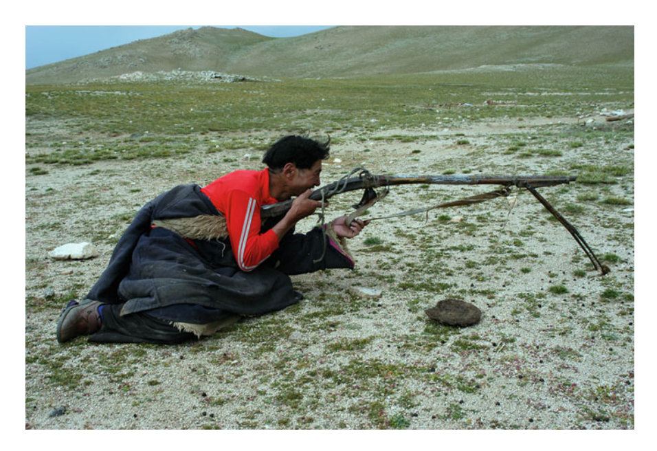
Photo 11.2 Hunting with a matchlock gun in northern Gertse